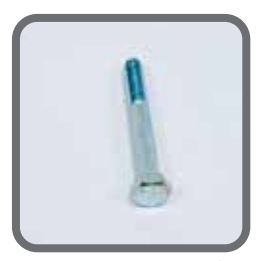
5/16 x 2.5" Bolts are used with nuts to assemble posts.