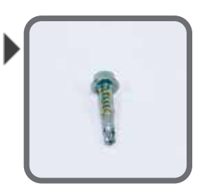
TEK Screws are used to attach panels to cage frame.