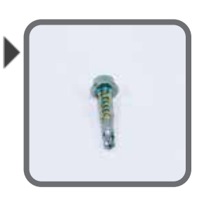
TEK Screws are used to attach panels to cage frame.